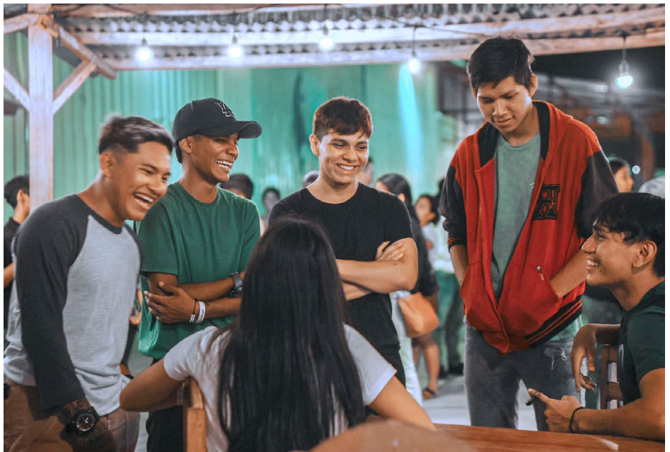
Fellowship at Genesis Church goes long after service is over.

The new addition will provide much needed space and an element of comfort for community life. The dining and living room feel will facilitate what already comes so naturally. It is one more way to tell people they are seen, wanted, and matter. Not only will the space be used on Sundays, but will be available throughout the week for people to gather. Thank you for praying and giving to this project!