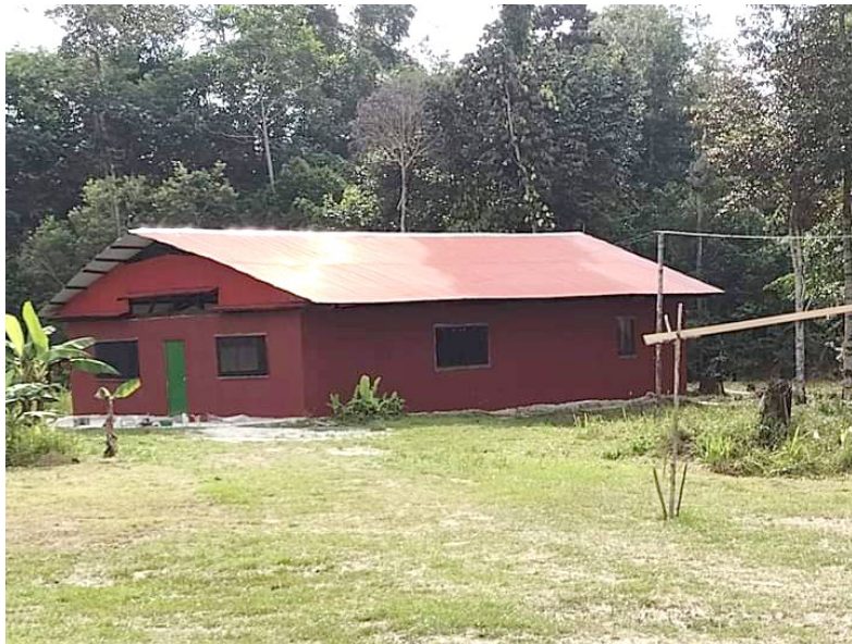
The new dining hall

There were many comments from the Peruvians about how amazing everything looks. Camp is becoming a place worthy of spiritual births! I love how they see something as simple as laying tile as a way to show value to a person coming to their encounter. It communicates that we have been waiting for them, and they are worth the work and effort! Even more so, God is worthy of our most excellent effort.