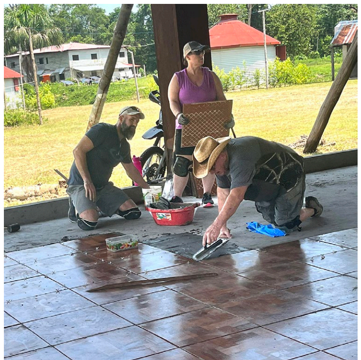
Marcus Team laying tile

It was the hottest week we had in a while, but that didn't stop the team of 16 from rolling up their sleeves and getting to work! They started tiling the camp chapel, laid dining hall flooring, built tables and benches, and got the storage container sorted and organized!